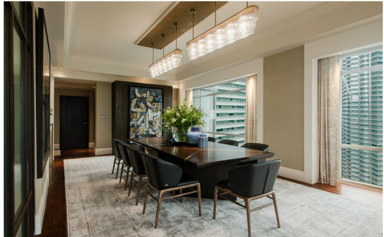
The dining room features the interactive work of Nor Tijan Firdaus and the Petronas Twin Towers just beyond its windows

Being a progressive space, each room offers a different emotion and tone. "We start with a vibrant, bold and playful energy by using a striking orange and black palette. As we move into the living room, I wanted to shift the energy and create a sense of calm and relaxation. To this end, I went with a warm palette of soft neutrals against earthy tones to capture a bit of a California chic, LA lifestyle vibe," Abraham elaborates.