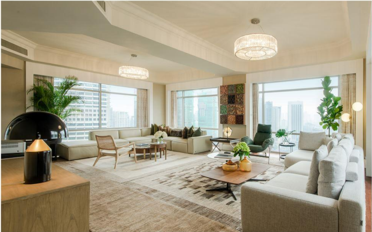
Tatler House Malaysia is an oasis of fine design and art

Indeed the result echoes Malaysian culture in a new and innovative way, where local talents are celebrated while the interplay of influences, materiality, and colours lends an unexpected edge for a space that is refreshing and unique in Kuala Lumpur.