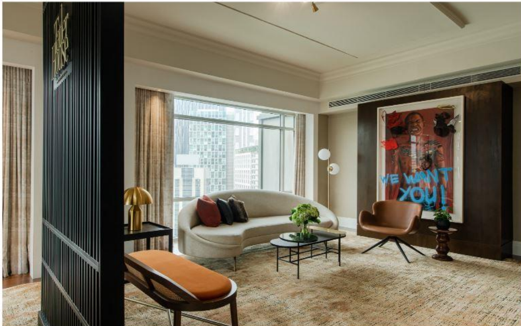
The arrival area features the Tatler House logo for guests to capture their Instagram moment